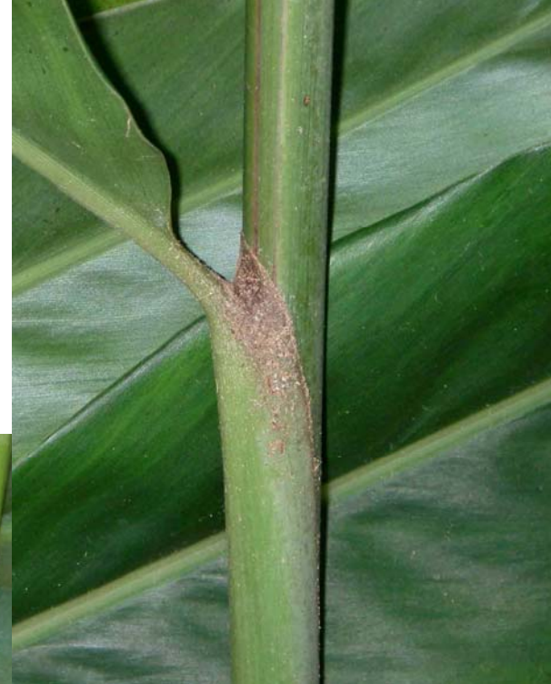
A. galanga L-88.0574 (H33, mauka of Areca macrocalyx)