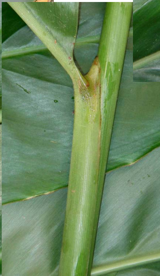
A. galanga L-83.0505 (?) (below sundial)